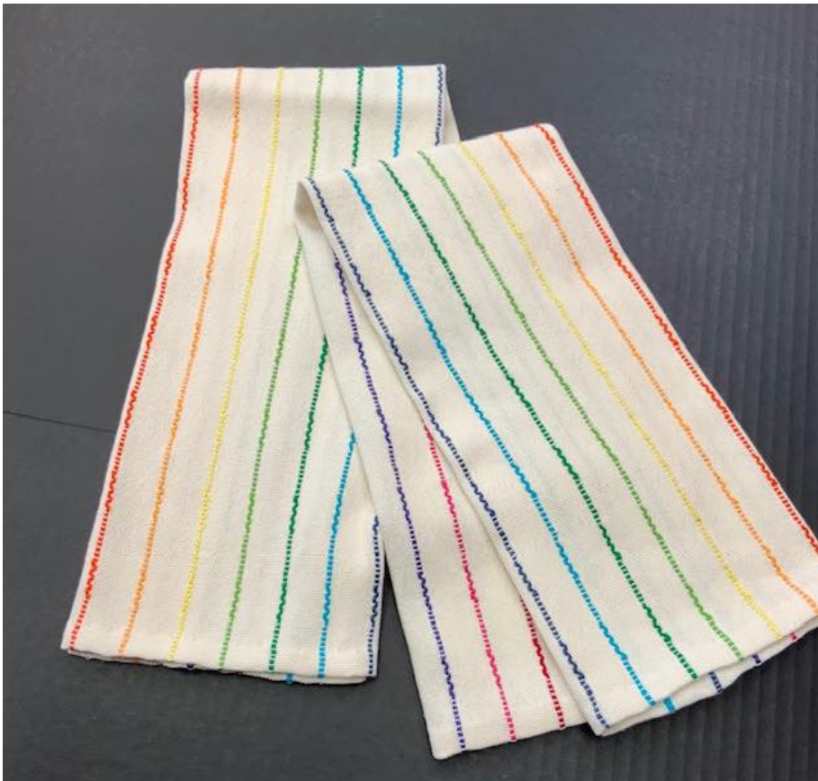
Catherine Marchant wove these towels for the HGA Convergence towel exchange. They are woven on four harnesses in 16/2 cotton with 5/2 perle cotton stripes. Harnesses 1 and 2 are the plain weave, and harnesses 3 and 4 are for the colored stripes. In the wavy areas, one colored thread is up, the other down, for 2 shots. Then reverse.