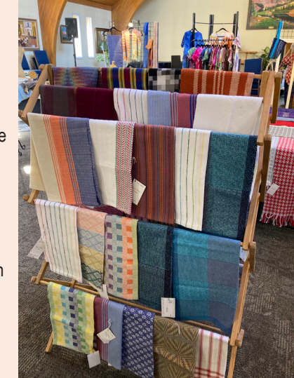
Towels at the Guild sale