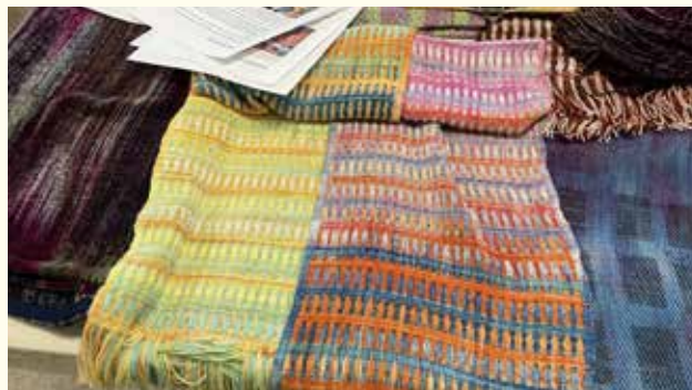
Items woven with dyed warps