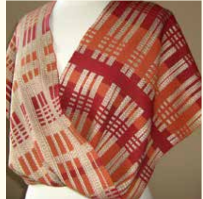
A garment woven by Karen Donde

“Do you ever get stuck trying to decide what to weave, knit, dye, or felt next? This lecture is designed to rev up your design engine and organize the many options available to you for creating cloth or the objects you make with it. Bring a stack of interesting pictures cut from magazines or old calendars, collecting whatever catches your eye. We will sort these by various design parameters and analyze your favorites. I'll then offer a few simple design tips and tools to help you formulate them into a design for your next project. This is told from a weaver's perspective, but can be applied to your favorite fiber technique.”