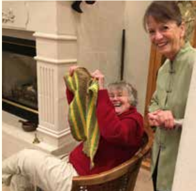
A happy memory from our Guild Christmas party