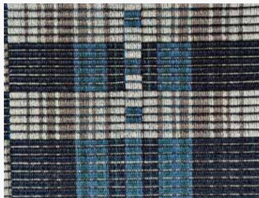
Rep weave sample

at 45 ends per inch. For reference, Rosalie Neilson in a workshop on rep weave recommended setting 5/2 cotton from 36 to 40 ends per inch, and Kelly Marshall, in her book Custom Woven Interiors: Bringing Color and Design Home with Rep Weave , recommends setting 5/2 perle cotton at 48 ends per inch.