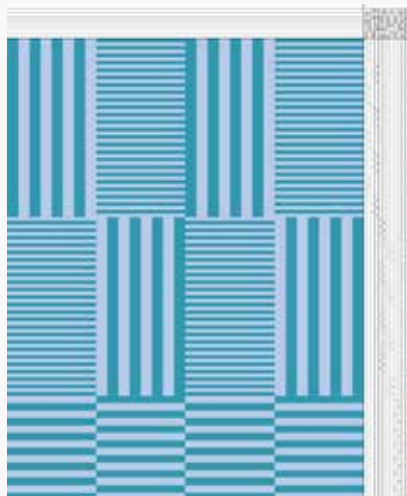
Draft c SCB 8 1942, 2 color 2-way rep weave shown as a warp faced weave.